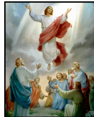
He ascended into Heaven and is seated at the right hand of the Father

Being seated at the right hand of the Father signifies the inauguration of the Messiah's Kingdom, the fulfilment of the vision of the Prophet Daniel concerning the Son of Man: "To Him was given dominion and glory and kingdom, that all peoples, nations, and languages should serve Him; His dominion is an everlasting dominion, which shall not pass away, and His kingdom one that shall not be destroyed."