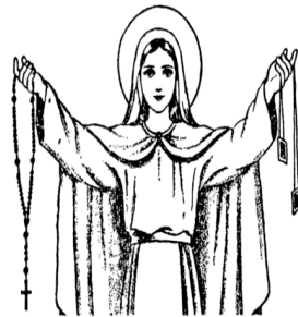
Blessed Virgin Mary to Saint Dominic, "One Day through the Rosary and Scapular I will save the World"

My God, I believe, I adore, I hope and I love You, and I beg pardon of You for those who do not believe, do not adore, do not hope and do not love You. Amen.