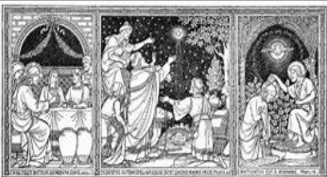
THE VISIT OF THE MAGI. THE BAPTISM OF OUR LORD. THE WEDDING FEAST OF CANA

On the 1st day of December, the First Sunday of the Advent of our LORD JESUS CHRIST, TO WHOM IS HONOUR AND GLORY for ever and ever. AMEN.