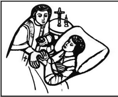
Image of the Sacrament of Anointing of the Sick

Please, keep Our Lord Jesus always before your eyes and mind and heart. Stay close to Jesus, and stay close to Mary our Mother: keep the Rosary with you always.