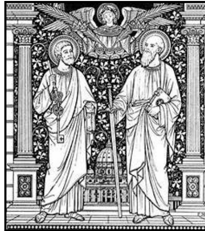
ST PETER AND ST PAUL: PRAY FOR US!

The Month of June is dedicated to the Sacred Heart of Jesus. The Month of July is dedicated to the Most Precious Blood of Jesus.