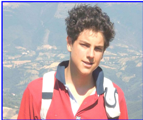
Blessed Carlo Acutis: (3rd May 1991 to 12th October 2006)

Carlo, who died aged 15 years, was noted for his cheerfulness, football, computer skills, and devotion to the Most Holy Eucharist. He took part in Holy Mass every day. He brought his Parents back to practice of the Catholic faith at the time of his