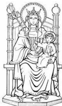
Our Lady of Walsingham: Pray for us! Our Lady of England: Pray for us!

A poster is displayed on noticeboards in the Church giving booking details for the coach, which will leave at 8.00am. Please consider joining this pilgrimage, if possible in person, or online at walsingham.org.uk/live-stream/