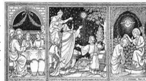
THE VISIT OF THE MAGI. THE BAPTISM OF OUR LORD. THE WEDDING FEAST OF CANA.

From the Roman Missal, Third Edition, Appendix I